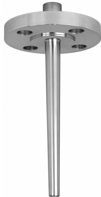
Thermowell with flange Model SI450F

Insertion length U 1 + connection length T